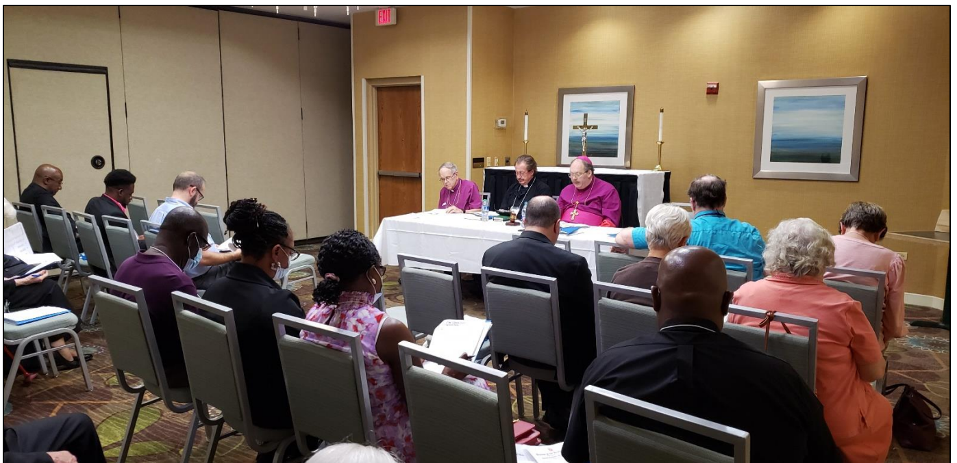
The Synod Business Meeting