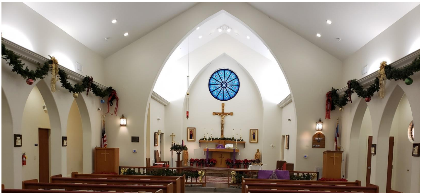
Saint Luke's, Advent IV, Ready for the Feast of the Nativity