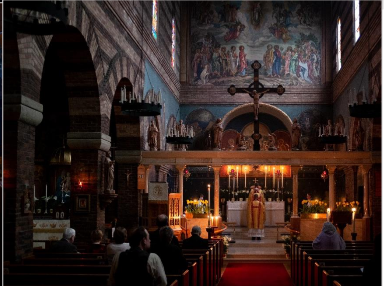
Upper Left, Blessing the New Fire Center Left, Singing the Exultet Lower Left, Litany of the Saints