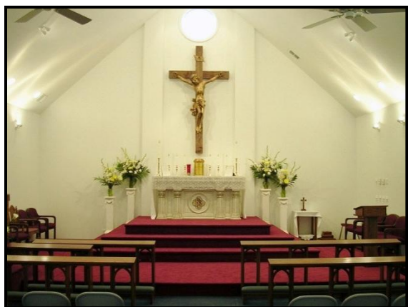
The Sanctuary as it appeared November 3rd, 2003, for the dedication of the church.